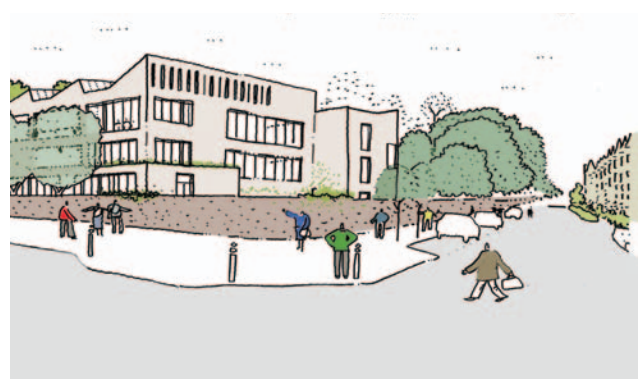
View to teaching building from Warrender Park Road

We plan to hold an event in early May for local residents close to the site. It is important to do this as they will raise some very specific issues relating to the proposals and we would like to explore these in greater detail with them. Arrangements will be confirmed and sent out to residents later in April when we have a clear picture of which issues need wider discussion.